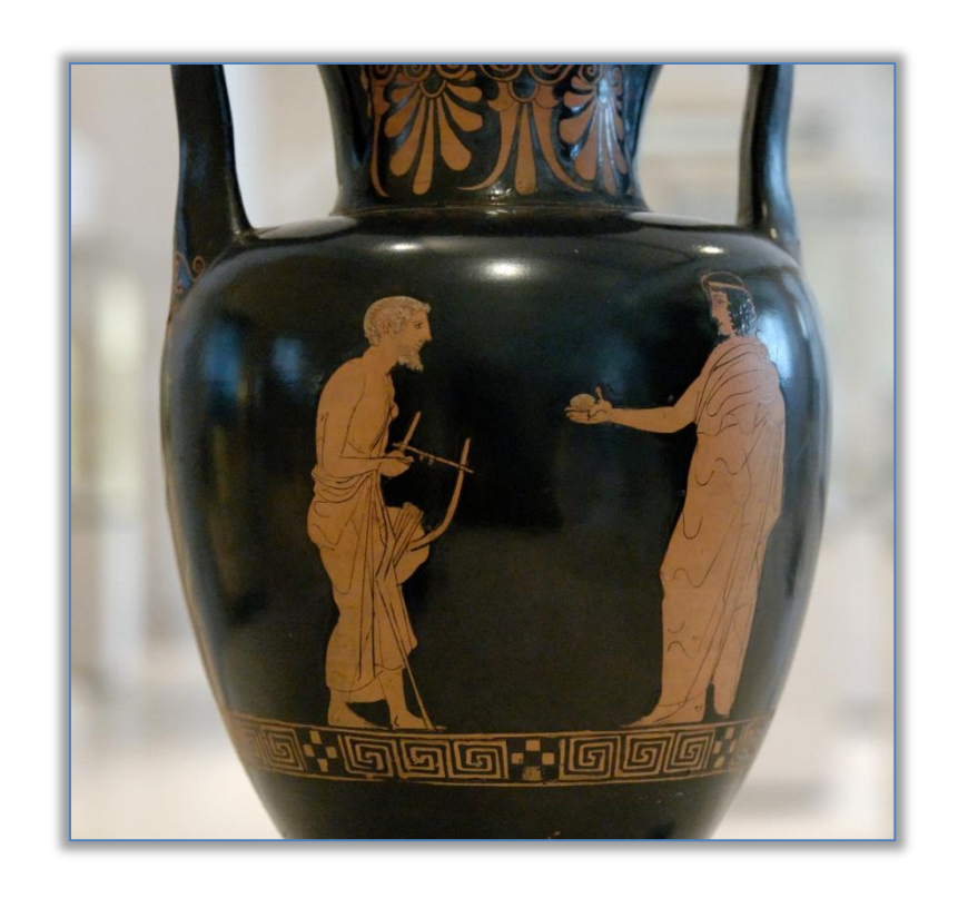
Mentoring Matters: effective academic advising at the research university